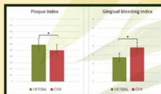
Comparison of the mean of difference in plaque index and gingival bleeding index among two mouthwashes

* The statistically not significant (P value \geq 0.05)