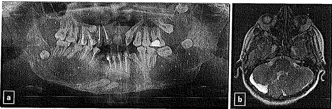
Fig. 1. (a) Multiple odontogenic keratocysts on a panoramic radiograph. (b) Vermian dysgenesis.

The odontogenic keratocysts that accompany this uncommon syndrome exhibit biological aggression and high risk of recurrence due to the high mitotic epithelial activity and frequency of satellite cysts 9, 10 . Treatment of the keratocysts varies from enucleation with peripheral osteotomies to resections 11, 12 . If the treatment of odontogenic keratocysts is neglected, the cysts may develop into severe complications such as jaw fractures or migration or mobilization of the teeth. Therefore, patients should be informed about the significance of odontogenic keratocysts and the likelihood of the development of further cysts.