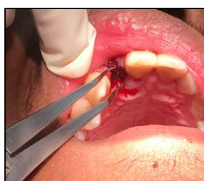
Figure 2 The wound distance was measured by using a dental caliper placed at the wound margin

The Phayayor oral pastes were given to the study group with the home-use instruction as followed. The wound and the adjacent area must be cleaned before applying the oral paste. Phayayor oral paste (Herb & Hope®) on the wound 4 times a day with provided checklist-time using a cotton swab or the finger. The participants were not allowed to drink or have any food within thirty minutes after the oral paste application. However, the Phayayor oral pastes or any other placebo were not given to the control group as it represents normal gingival wound healing.